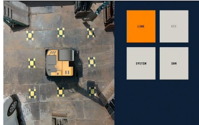
Main menu screen