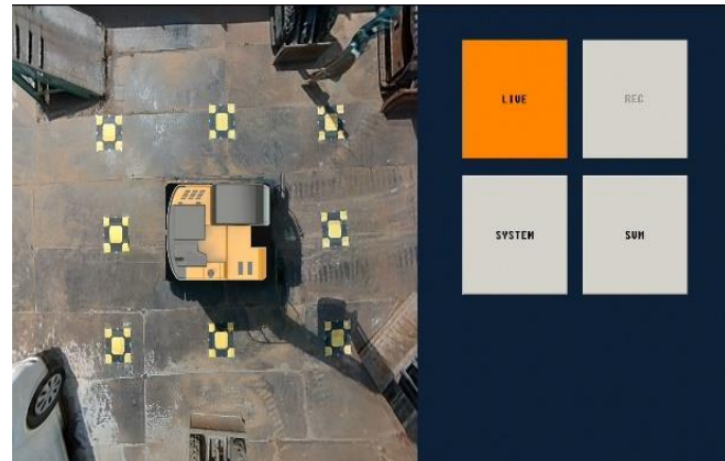
Main menu screen